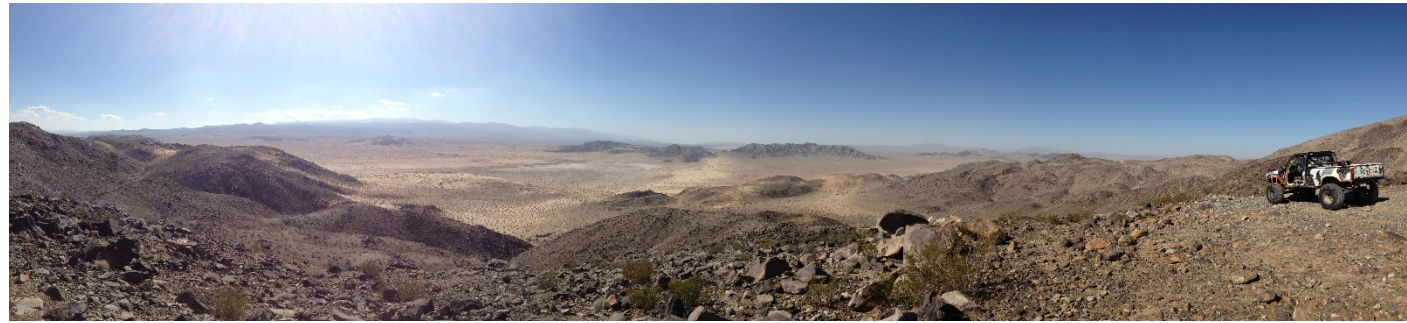
Means Dry Lake after it rained 4 inches in 18 hour period October 2018.

April May June 2021 An award-winning publication. A monthly publication of the Dirt Devils a 501(c)(7) corporation 960 N Tustin St #120 Orange CA 92867 http://www.dirtdevils.org/